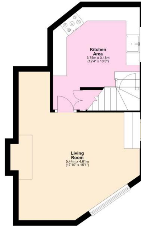
Ground Floor Approx. 29.2 sq. metres (314.4 sq. feet)