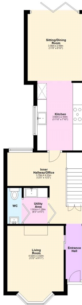
Ground Floor Approx. 47.8 sq. metres (515.0 sq. feet)